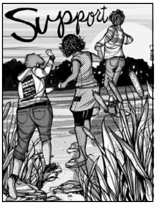
Art by Cristy C. Road, croadcore.org

Community-based responses to violence have a long history in many of our communities and networks, and have often been developed in contexts where we could not rely on the state or larger community to protect us from violence (such as Black communities in the slavery and post-slavery eras, immigrant communities, queer communities, and Indigenous communities). But these practices may not necessarily be called "community accountability" and can look very different depending on the circumstances.